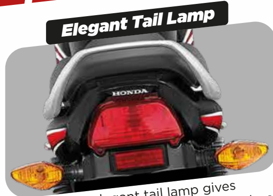
Elegant Tail Lamp Bright and elegant tail lamp gives the bike an imposing look from the back.