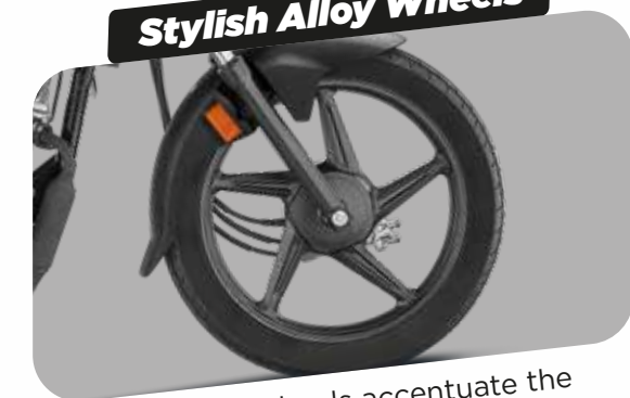
Stylish Alloy Wheels All-black alloy wheels accentuate the overall look of the bike.